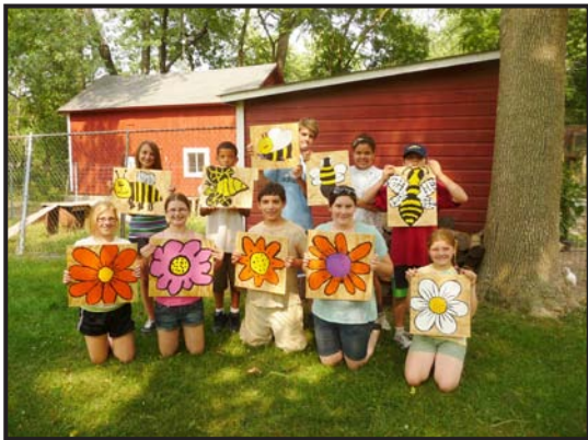
Our older campers from last summer designed flowers and bees that now adorn the honey house.