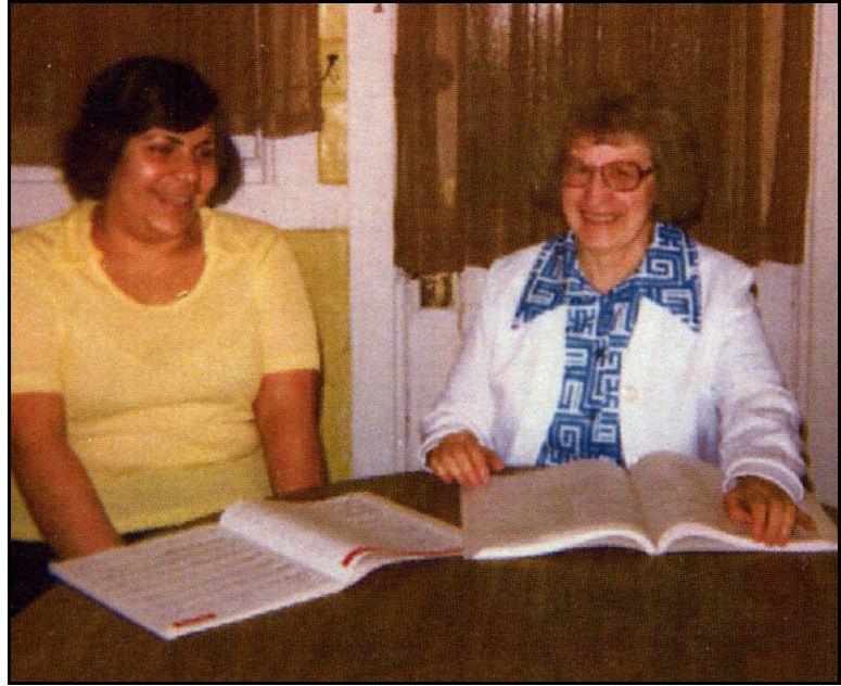
With a student at Siena Center, 1982

from 1936 to 1937 at Saint John's in Hubbardston, Michigan; from 1937 to 1938 at Saint Benedict the Moor in Milwaukee; from 1938 to 1939 at Saint Bernard's in Madison; from 1939 to 1940 at Saint Clement's in Center Line, Michigan; from 1940 to 1941 at Saint Edward's in Racine; from 1941 to 1943 back at Saint Benedict's; from 1943 to 1944 at The Calaroga in Milwaukee (the congregation's boarding house for working girls); from 1944 to 1945 at Saint Edward's again; from 1945 to 1948 at Saint Francis Xavier in Merrill; from 1948 to 1949 at Saint Augustine's in Wausaukee; from 1949 to 1951 once again at Saint Benedict's; from 1951 to 1952 at Holy Angels in Milwaukee; from 1952 to 1953 at Saint Louis in Caledonia; from 1953 to 1958 at Saints Peter and Paul in Green Bay; from 1958 to 1960 at Saint Luke's in Plain; from 1960 to 1968 at Holy Name in Kimberly.