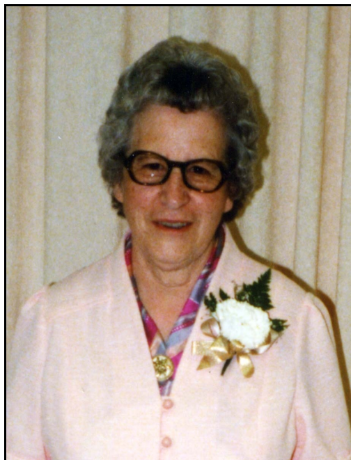
Golden Jubilee, 1985