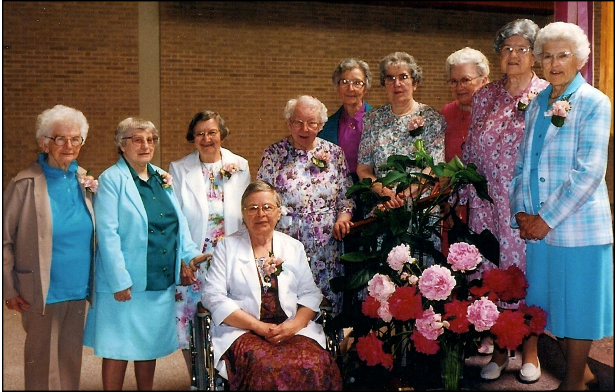
Diamond Jubilee, 1995