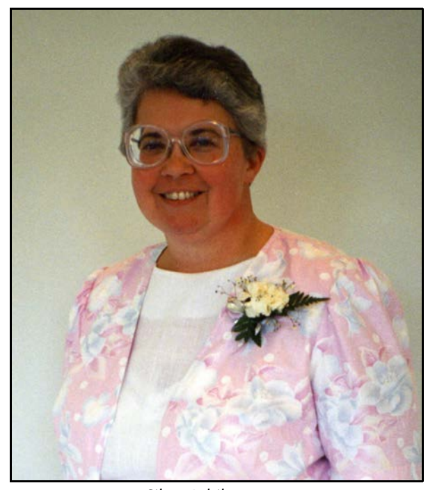
Silver Jubilee, 1990

She lies at rest in the community plot in Holy Cross Cemetery in Caledonia.