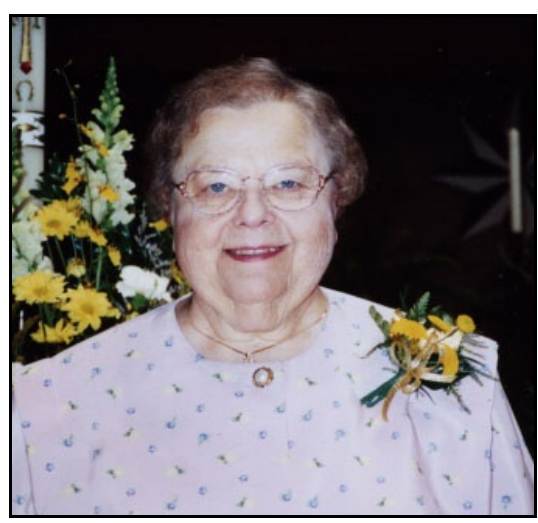
Golden Jubilee, 2001

When she came to visit at the old family farm, she always wanted to play sheephead, the long-time family card game. And she would make her own special potato salad.