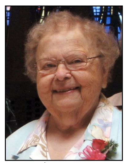
40 <sup>th</sup> Jubilee, 2011

All the Lord requires is that you do justice, love goodness, and walk humbly with your God. Micah 6,8