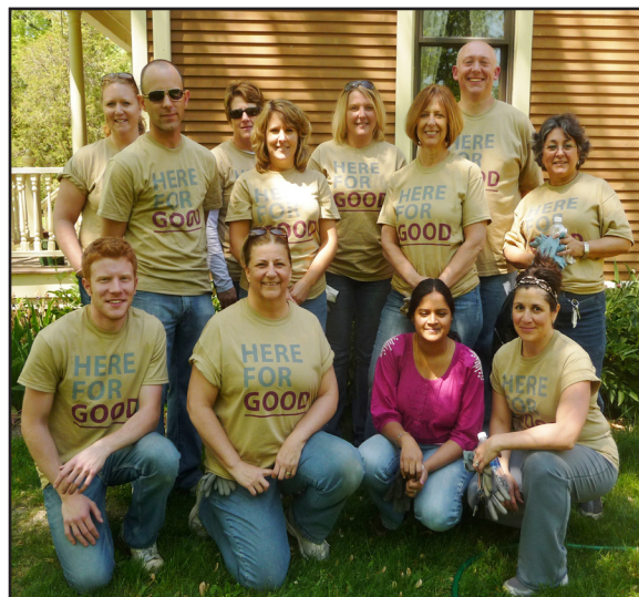
Johnson Bank volunteers were “Here For Good” one day in May as they spent hours scraping, painting, weeding, spreading wood chips, and cleaning.

“The protection of Earth’s vitality, diversity, and beauty is a sacred trust.” - The Earth Charter