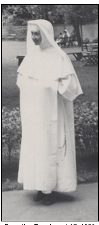
Reception Day, August 17, 1950