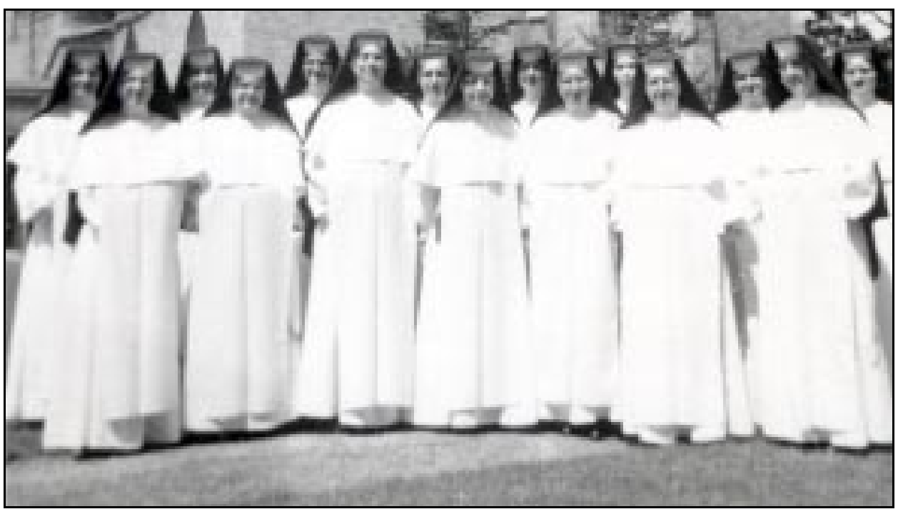
The final profession class, 1958

She spent the summer of 1958 at the motherhouse, preparing for and celebrating her final profession, and was then assigned again to Our Lady of the Oaks. The 1960 to 1962 terms found her back in Osmond. In the fall of 1962 she moved again to Pewaukee. Assignments followed at the motherhouse (1964 to 1965), Villa Saint Anne (1965 to 1967), and OLO (1967 to 1977).