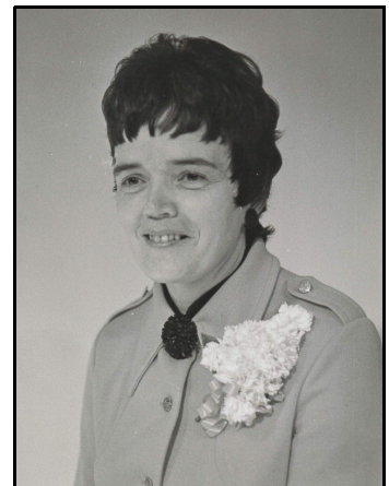
Silver Jubilee, 1974