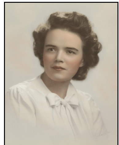
High School Graduation

After high school, she accepted an invitation to teach with the Racine Dominicans at Saint Mary's in Janesville, Wisconsin, and while there, on February 2, 1947, became a postulant. Back in Racine on the following August 4, she received the Dominican habit and the name Sister