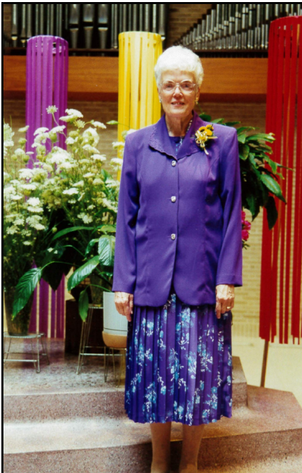
Golden Jubilee, 1999

In 1978 she co-founded the Senior Companion Program based at Siena Center, serving as its director until 1980. At that point she accepted an invitation to become episcopal delegate for Christian education for the Archdiocese of Milwaukee, a post she filled until 1988. From 1988 until 1995 she worked in educational research and development in Racine.