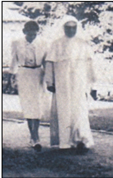
Reception Day, 1941

She was fourteen when she entered the Racine Dominican community as an aspirant on August 30, 1939, and was immediately put to work at Saint Anne's Home, the congregation's residence for elderly ladies, then located on Thirteenth Street. In the fall of 1940 she was sent to assist with food service for the sisters at Saint Patrick's in Racine.