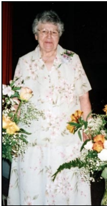
60 th Jubilee, 2006