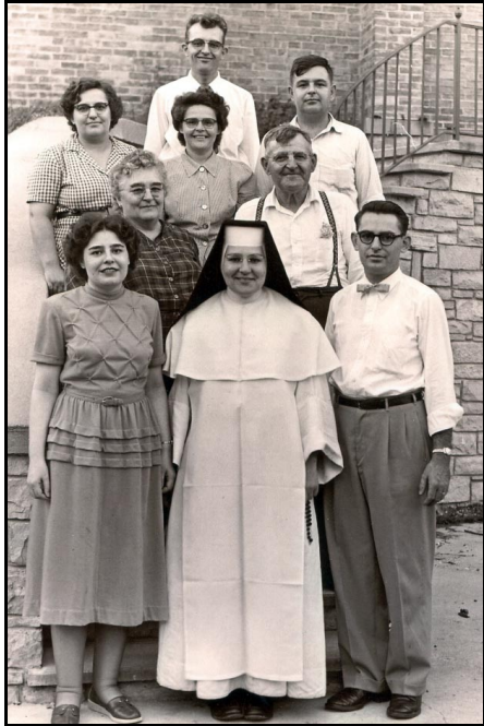
With her family, about 1955

Wisconsin. She would celebrate her final profession on February 2, 1952.