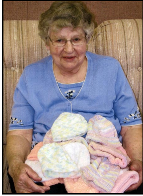
Caps for newborns

prolonged care-giving ministry, until the fall of 1990.