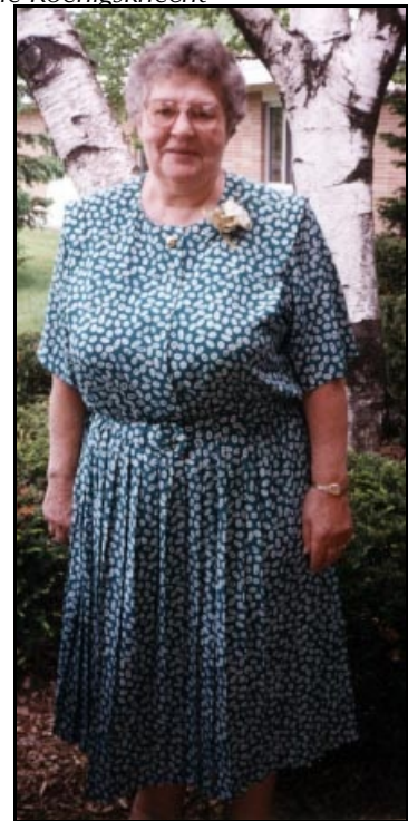
Golden Jubilee, 2001